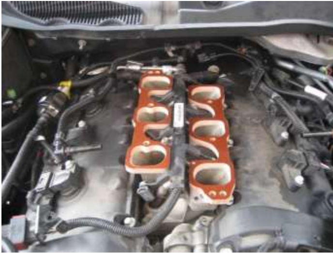
Lay the spacers on the lower manifold.

Step 1: Trial fit the manifold with the spacers.