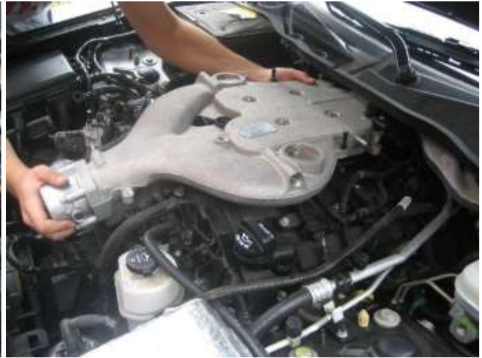
Gently set the manifold on the spacers.

If you cannot install and torque the rear most bolt then you will have to remove the windshield valance as shown in Part 3.