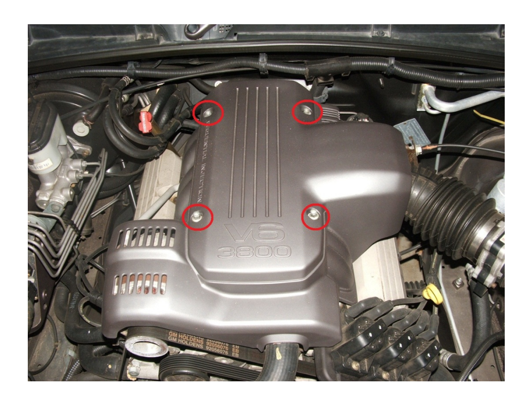
The engine cover can then simply be lifted off the engine